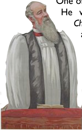
John Charles Ryle

One of the contributors on the “special committee” was Anglican Bishop, John Charles Ryle. He wrote an article in The Fundamentals concerning what he called the “True Church” (Referring to the so-called universal church). He supported his position with absolutely no Scripture. What else could he do? No Scripture can be found to support his position. The “universal church” virus was one of the foundational blocks for what we call fundamentalism. Ryle began his discussion with the question “Do you belong to the one true Church?” Ryle’s question plainly suggests that your local church is not the “true church.” Referring to their “special committee” Ryle also said, “Its members are entirely agreed on all the weightier matters of religion, for they are all taught by one Spirit.”