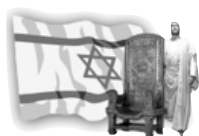
The Kingdom Message