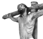
The Plan of Salvation