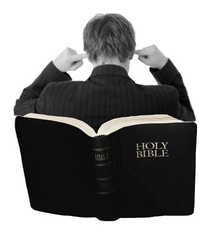
We Should Have Listened