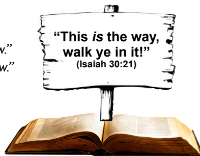
“Thy Word Is Truth” (John 17:17)