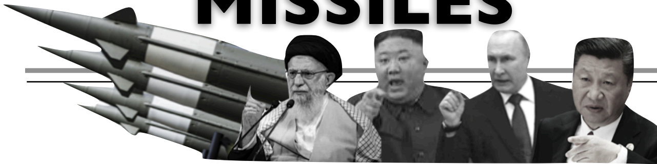
Iran N. Korea Russia China

It is impossible to see today's headline news without seeing the amazing fulfilment of Bible prophecy.