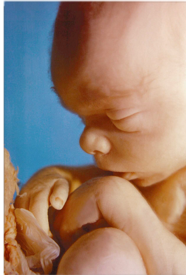
Every twenty-seconds an unborn child is murdered in the USA.