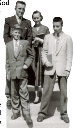
We Will Serve The Lord