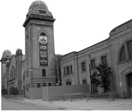
Coliseum - Exhibition Place, Toronto

to the cause of Christ. The fact that I mention that I was saved in one of his crusades should not be taken as an endorsement of his unscriptural ministry.)