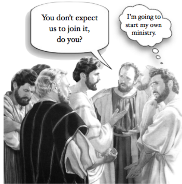
Jesus said, “I will build my church...” (Matthew 16:18).

Universal Church? Third John 1:10 , “ Casteth them out of the church. ”