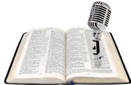
Conclusion of proof texting series

"But speak thou the things which become sound doctrine." (Titus 2:1)