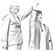
Mandela And Gaddafi