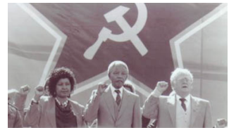
Winnie, And Nelson Mandela With Communist Yossel Slovo At An ANC Rally In 1990

The nation's great cities like Durban and Johannesburg, which once rivaled cities like Vancouver or Toronto have become decaying crime-ridden slums within the past ten years.