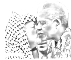
Mandela And Arafat