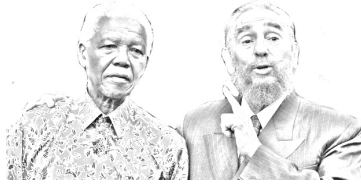
Mandela And Fidel Castro